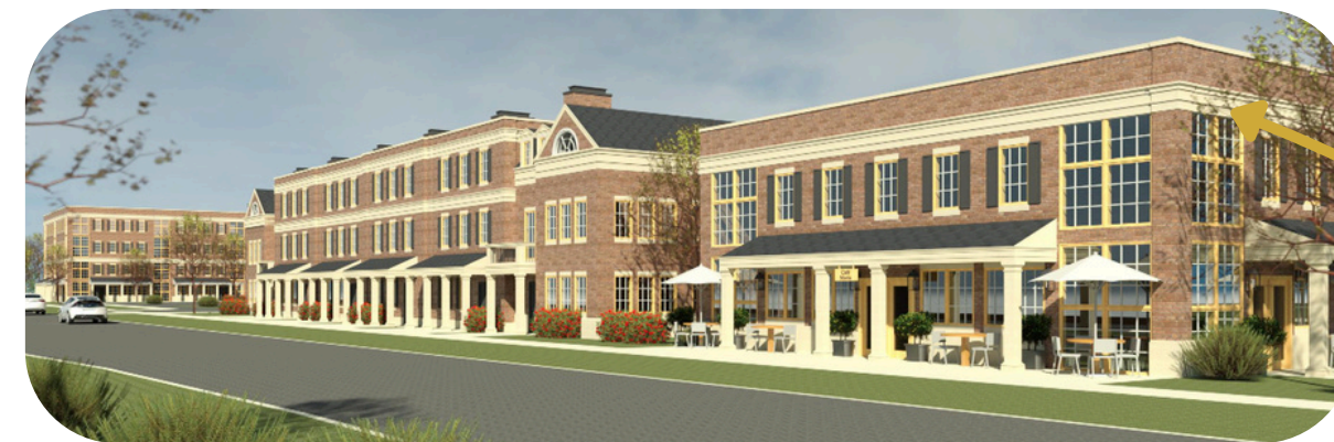
Coffee shop, community meeting space, and coworking space