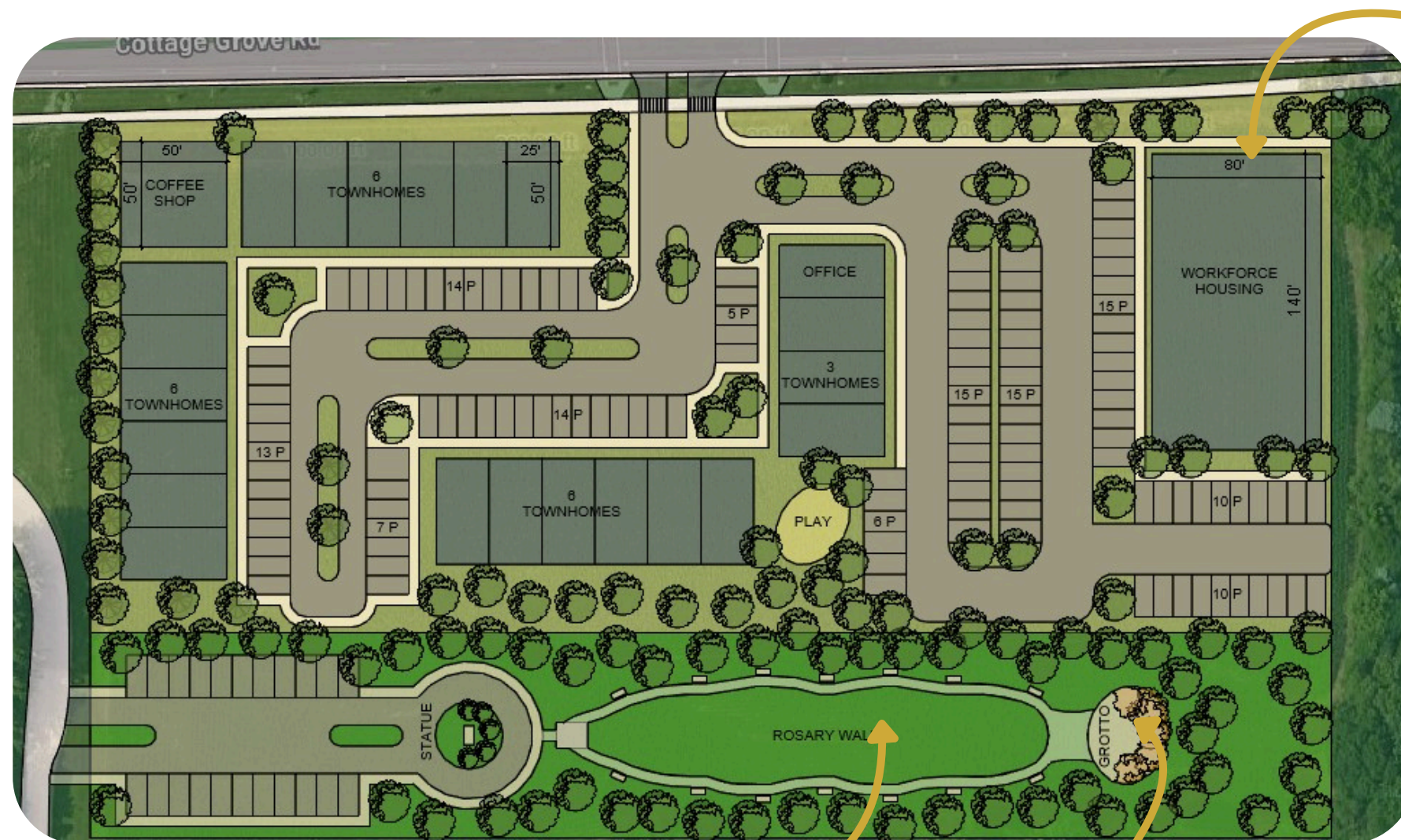
Mixture of town homes, row houses, and workforce housing

We work with clients looking to bring the Catholic faith to their built environment, including but not limited to dioceses, parishes, and mission-focused non-profits looking to create housing. Below is an example project.